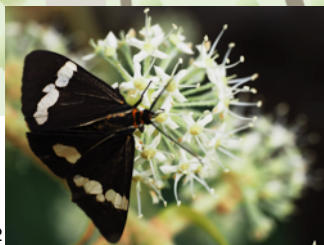
Left: Rice Paper Plant Tetrapanax papyrifera in GBG. Page 1 photo (right): Cussonia spicata

This information was developed by the Volunteer Guides Friends of Geelong Botanic Gardens.