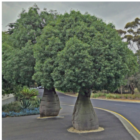
Photos: Left: Queensland Bottle Trees Brachychiton rupestris , Right: Red Osier Dogwood Cornus sericea (synonym C. stolonifera )