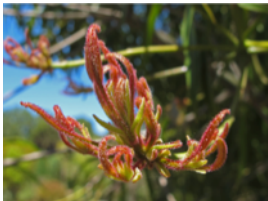
Queensland Bottle Trees Brachychiton rupestris , sprout red, new leaves.

www.friendsgbg.org.au www.geelongaustralia.com.au/gbg/