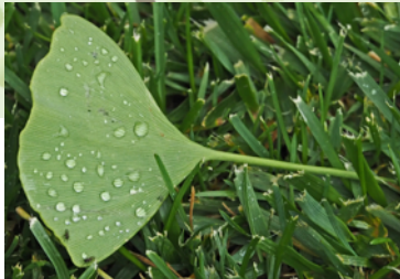
A leaf of Ginkgo biloba

This information was developed by the Volunteer Guides Friends of Geelong Botanic Gardens. www.friendsgbg.org.au www.geelongaustralia.com.au/gbg/