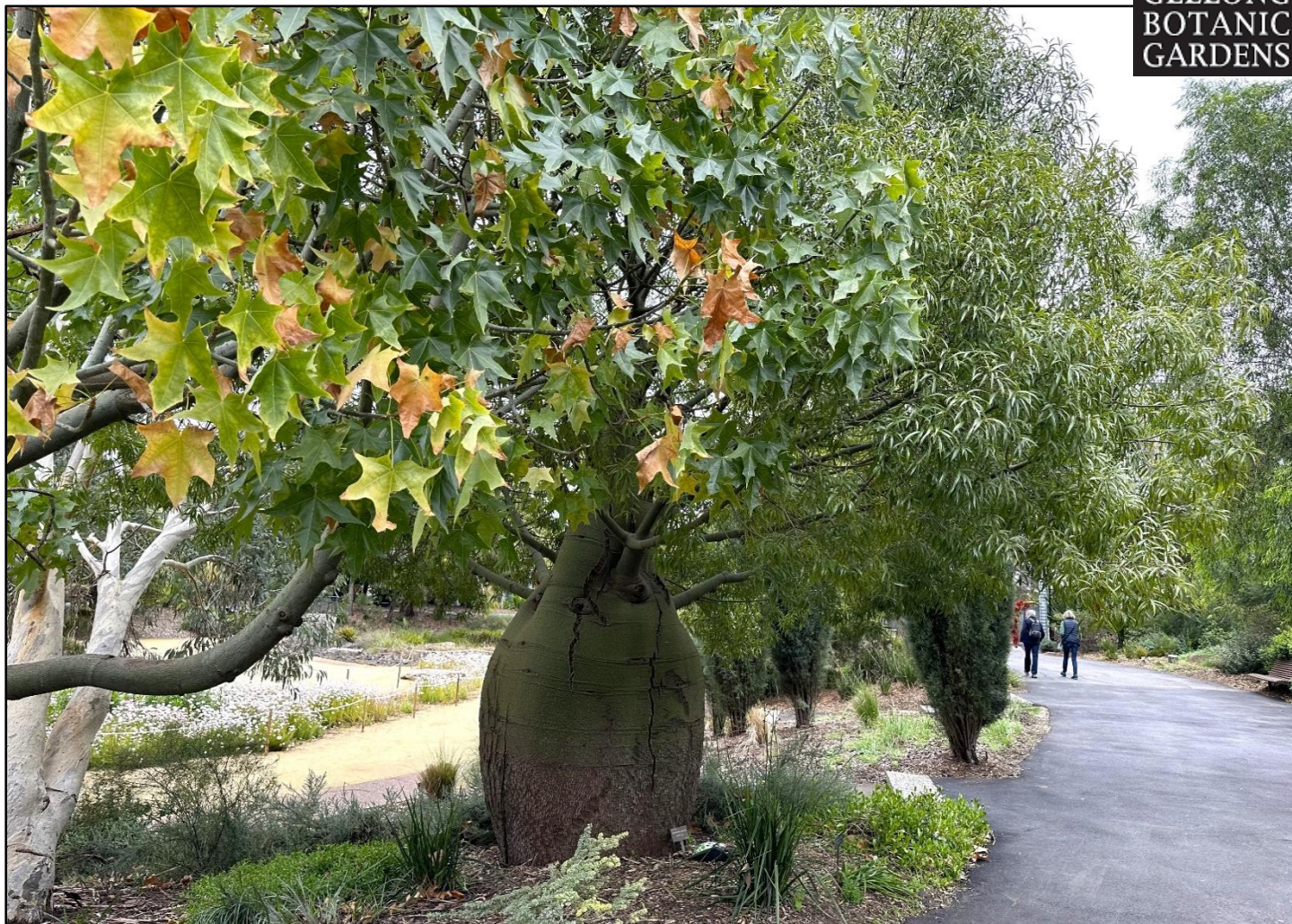
Springtime in the 21 st Century Garden