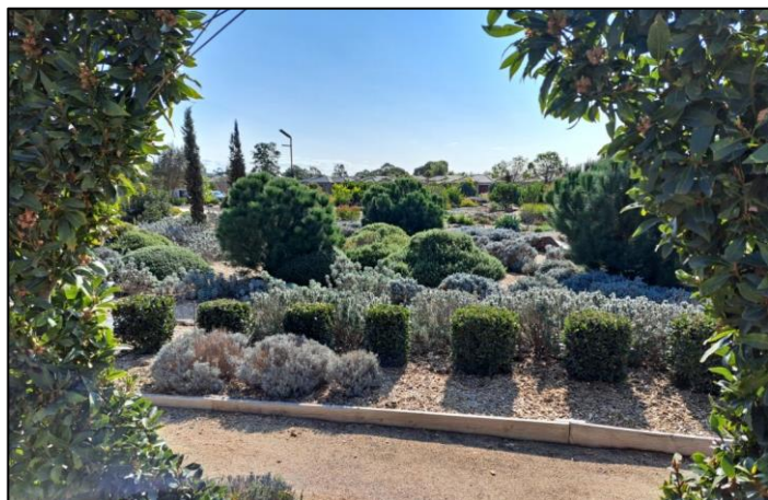
Looking from the amphitheatre through the herbaceous window