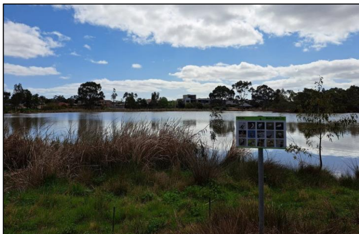
View across the main lake

At midday we met at the Friends' shed at the north end of the garden where we were served a delicious lunch by volunteers. After lunch there was time to browse and purchase plants in the nursery.