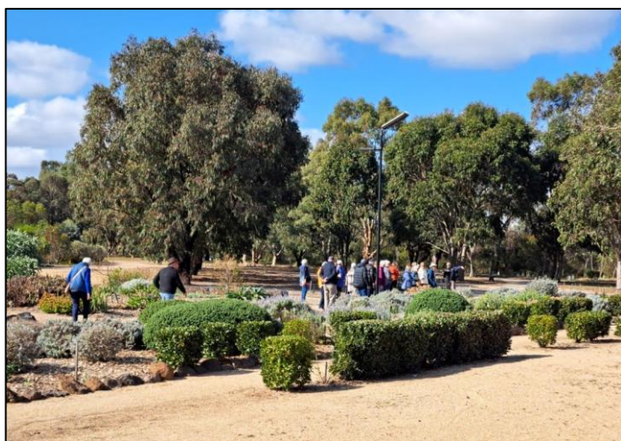
Tour group being guided by John Bentley

For example, there are 4 arboretum areas of eucalypts. With approximately 100 different species on display.