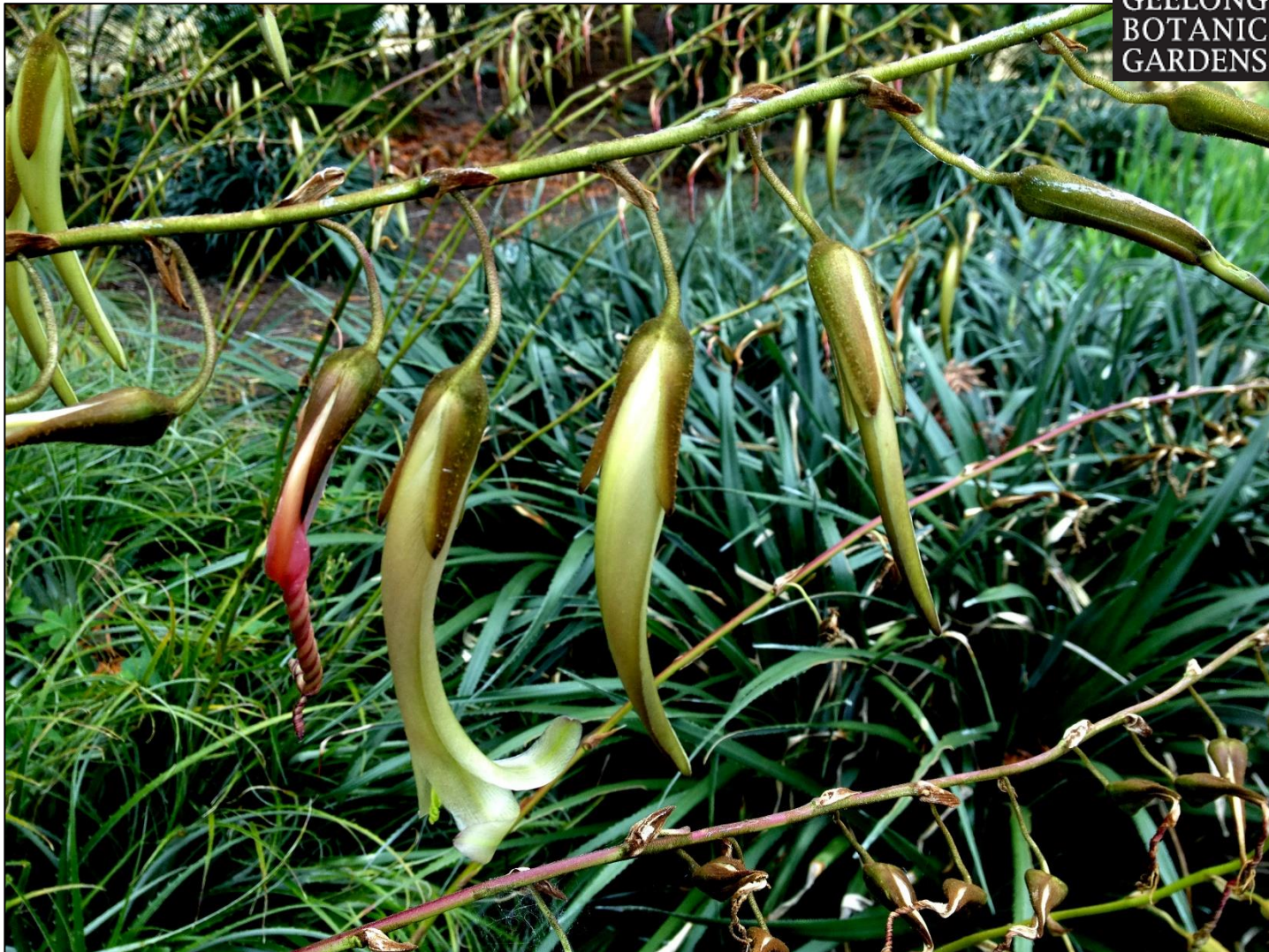
Puya ferruginea located in the 21 st Century Garden and the 19 th Century Garden.