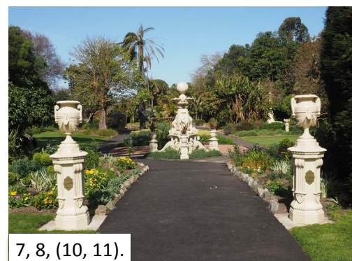
7, 8, (10, 11).