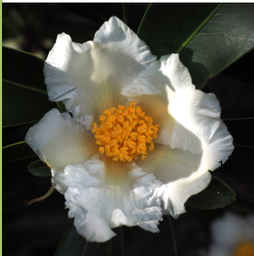
Fried Egg Plant Gordonia axillaris