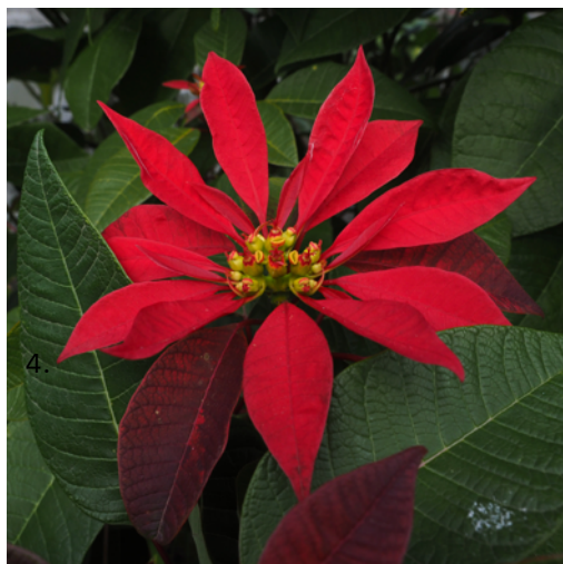
Poinsettia Euphorbia pulcherrima

You may think that spring and summer are the seasons for flowers, but many plants are not deterred by the winter chill. Visit the Camellia Walk to see Azaleas, varieties of Camellias and Fried Egg Plant Gordonia axillaris . Camellias and Gordonias are in the family called Theaceae. This family is named for its most valuable Camellia, the Tea bush.