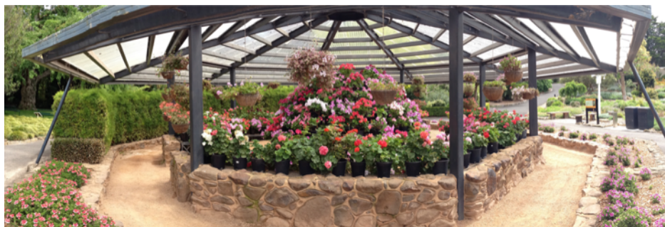
Photo: Pelargonium House

The Pelargonium House has re-opened. Its recent renovation includes an irrigation system. The display in the Pelargonium House is changed as different plants come into flower.