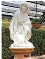
Pelargonium House Statue of Ruth gleaning wheat