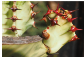
Photo: Less than a years after being damaged, the Pale Euphorbia Euphorbia ammak showed new growth and healthy thorns.

www.friendsgbg.org.au www.geelongaustralia.com.au/gbg/