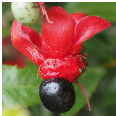
Above: Mickey Mouse Plant Overleaf: Panorama of Perennial border and another photo of Mickey Mouse Plant

The Mickey Mouse Plant Ochna serrulata has attractive yellow flowers that are followed by striking fruit. After starting green, the fruit turn to black glossy balls by the end of summer. Behind the fruit are vivid red sepals. Although there may be up to 5 fruit in front of the sepal, the more usual number is two. With and without fruit, they can appear quite comical, as shown in the photos on both sides of this leaflet. Where the fruit don't develop there remain small black 'eyes'. See what comical shapes you can find on the bush.