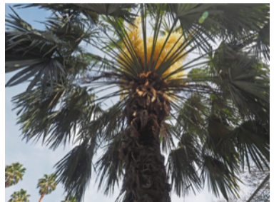
Top: Tall Grass Tree Xanthorrhoea malacophylla near entrance. Middle: Another Grass Tree with only a few flowers remaining. Bottom: Cabbage Tree Palm Livistona australis in flower.