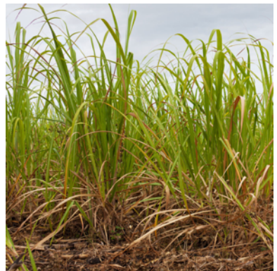
Top: Murnong or Yam Daisy Microseris scapigera roots are good to eat, cooked. GBG. Middle: Murnong Microseris lanceolata has a daisy flower. Bottom: Sugar Cane Saccharum grows tall in the tropics.