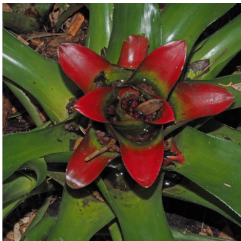
Bird's-nest Bromeliad Nidularium innocentii

Visit the Camellia Walk to see in flower: Camellia and their cousins Gordonia , Azalea , Magnolia , Hydrangea and their cousins Dichroa , and Mahonia . These gardens have more than 80 kinds of Camellia .