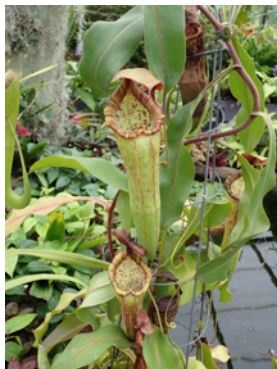
In the Conservatory: Left: Lobster Claws Heliconia , Right Pitcher Plant

The Conservatory is now open every day from 10 am to 4 pm. See whether you can spot plants that you eat or use frequently, but may not have seen growing.