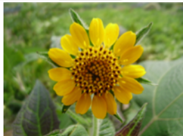
Flower: Peruvian Apple Smallanthus sonchifolius