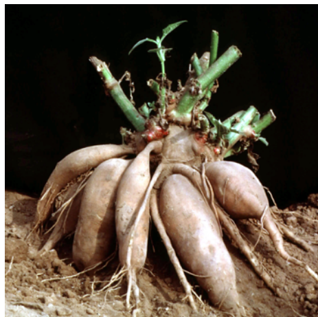
Photos: Left: Peruvian Apple Smallanthus sonchifolius (NusHub Wikimedia CC BY-SA 3.0) Right: Dawn Redwood Metasequoia glyptostroboides GBG

The central bed is displaying a range of edible plants . The edible parts of most of them are under the ground: roots and tubers. Look for the Peruvian Apple or Yacón Smallanthus sonchifolius , that has refreshing, mildly-sweet, juicy, tubers. It grows like a small sunflower.