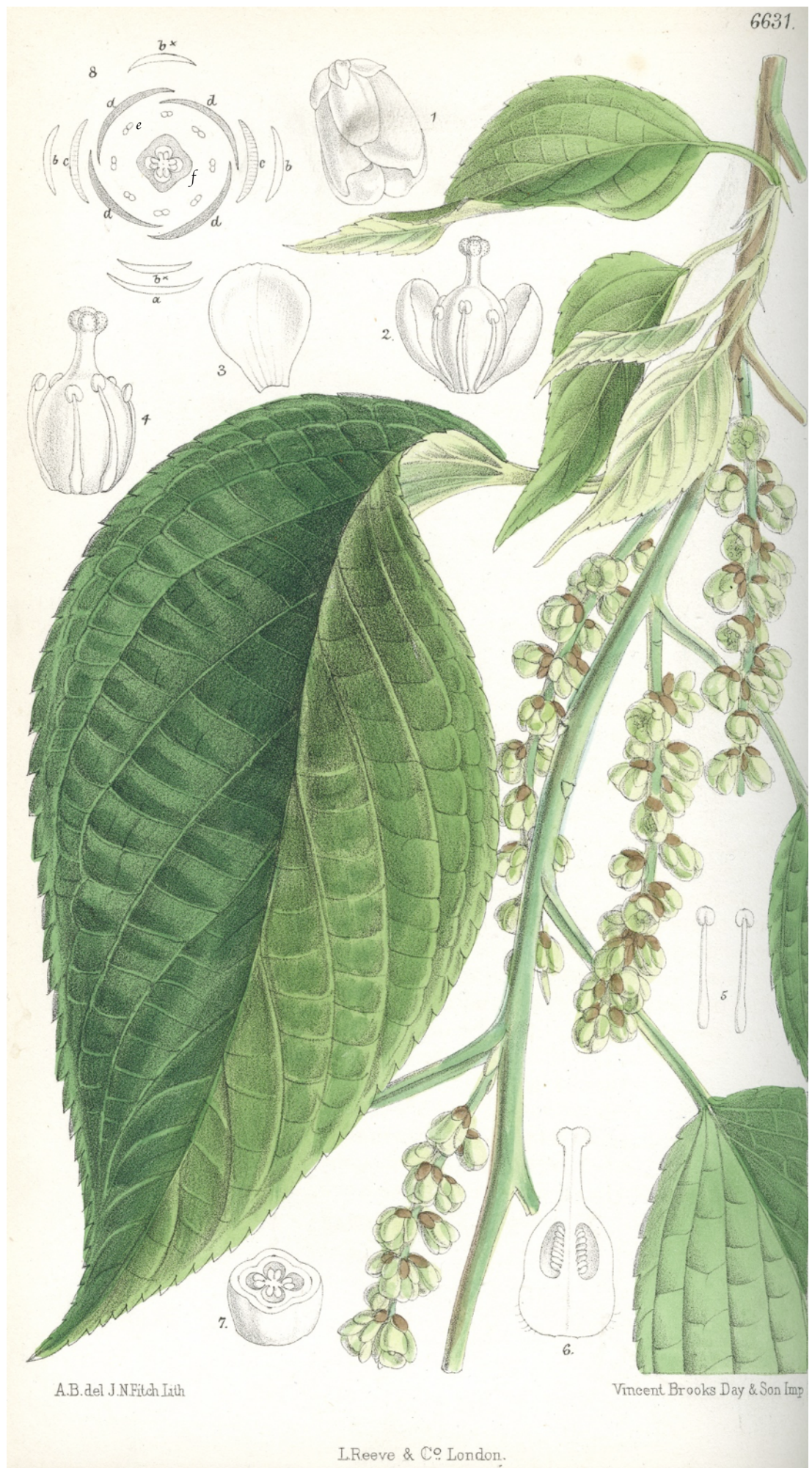
Stachyurus praecox : parts of the plant. 1. flower; petals, stamens & pistil (non-functional) of a bisexual flower; 3 petal; 4 stamens and ovary; 5 stamens; 6 vertical and 7 transverse sections of ovary; 8 floral diagram: a & b: sepals, usually 4 outer small brown sepals (only 3 shown here), b* & c: 4 inner larger light green sepals (2 outer small, 2 inner larger); d: 4 petals larger than sepals, e: 8 stamens; f: ovary & stigma. Image: Curtis's Botanical Magazine, Hooker JD 1882, p6631; from herbaria.plants.ox.ac.uk