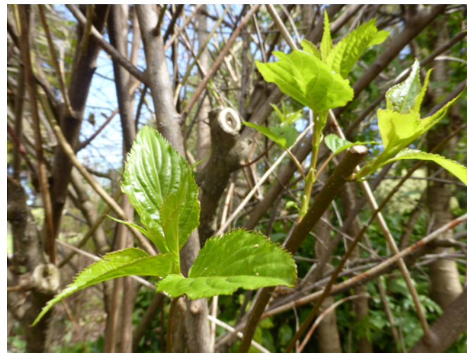
Stachyurus praecox The plant is flowering and new leaves have begun to appear. GBG September 2018.