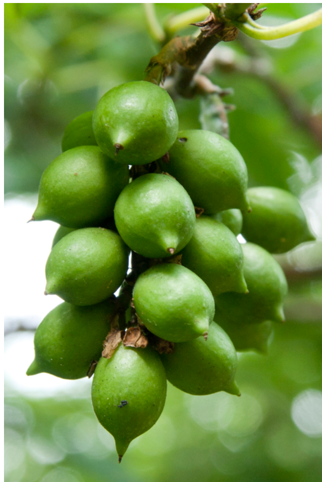
Stachyurus praecox fruit.