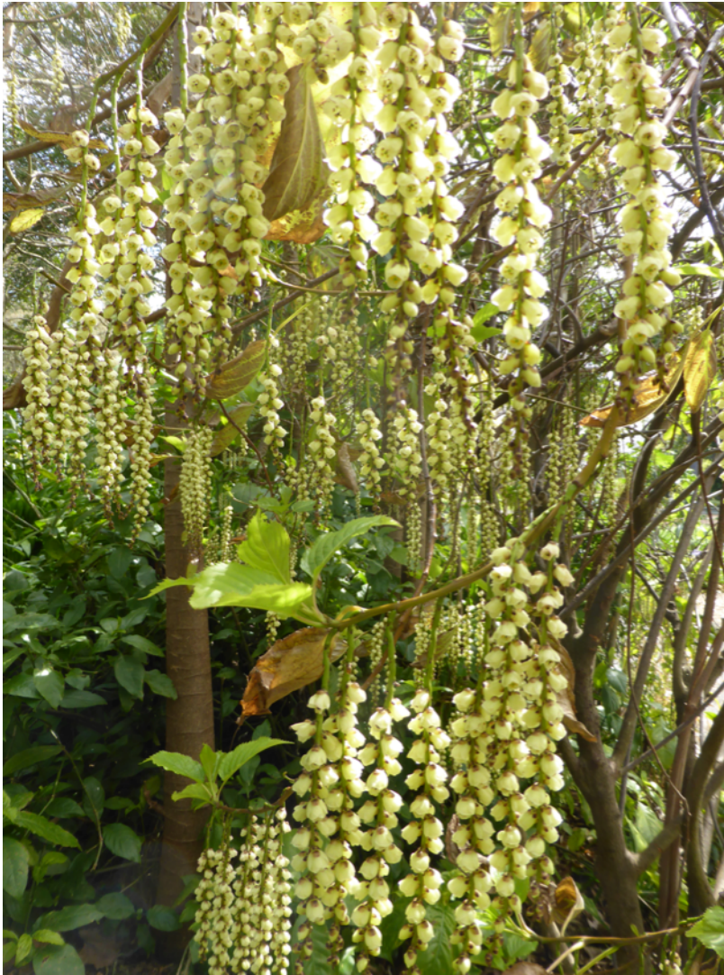
Stachyurus praecox catkin-like inflorescences GBG. September 2018.

The genus Stachyurus is native to areas from the Himalayas through China to northern Indochina and Japan. Stachyurus is the only member of the Family Stachyuraceae. While the family is now generally accepted, its placement among other families is still in dispute.