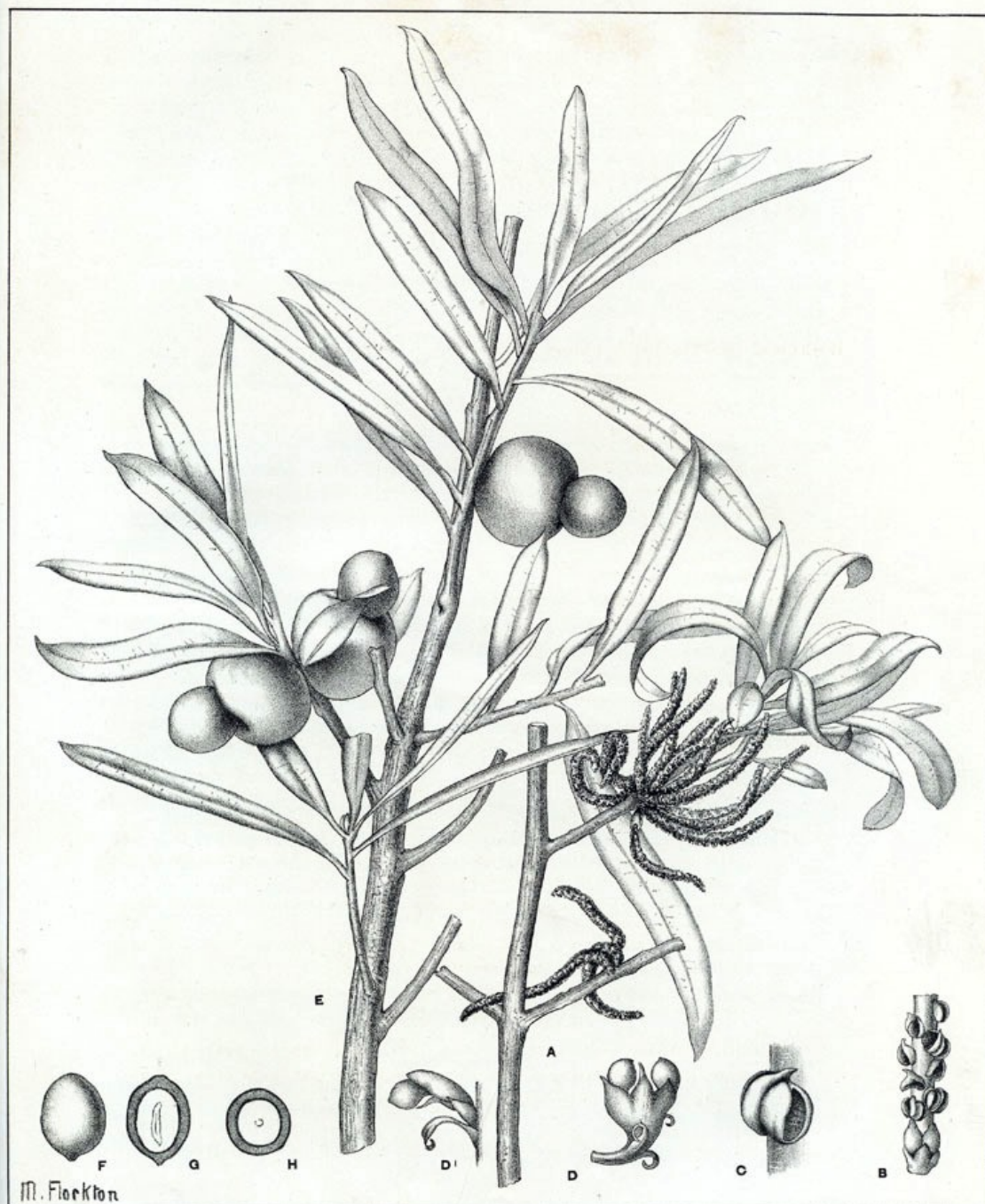
WHITE OR SHE PINE.