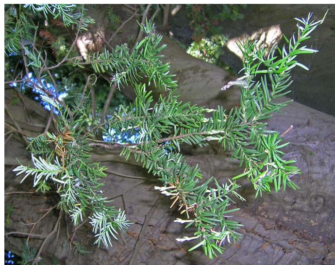
Prumnopitys andina photos, from the top: