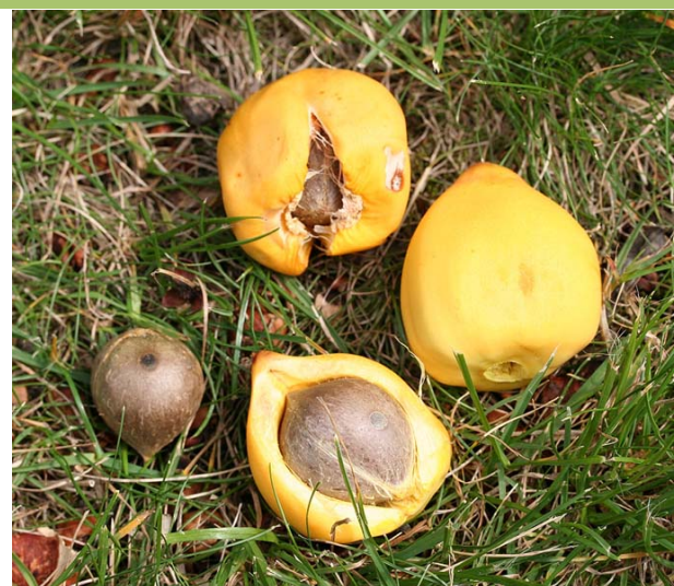
Jubaea chilensis fruit with flesh and seeds RTBG Hobart

The sap from the Chilean wine palm can be fermented into a palm wine or, as is more common today, concentrated into a sweet syrup (palm honey or miel de palma.) for culinary uses. In order to obtain the sap, the trunks are felled and the crown cut from the apex of the stem. The sap then drains out over a period lasting several months, sometimes yielding more than 300 litres. In addition to production of palm honey, the edible seeds are also harvested and the leaves are used to make baskets.