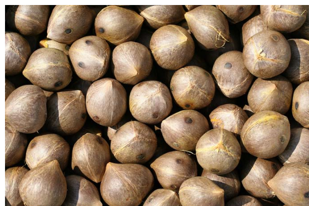
Jubaea chilensis Seed showing the 'eyes' RTBG Hobart