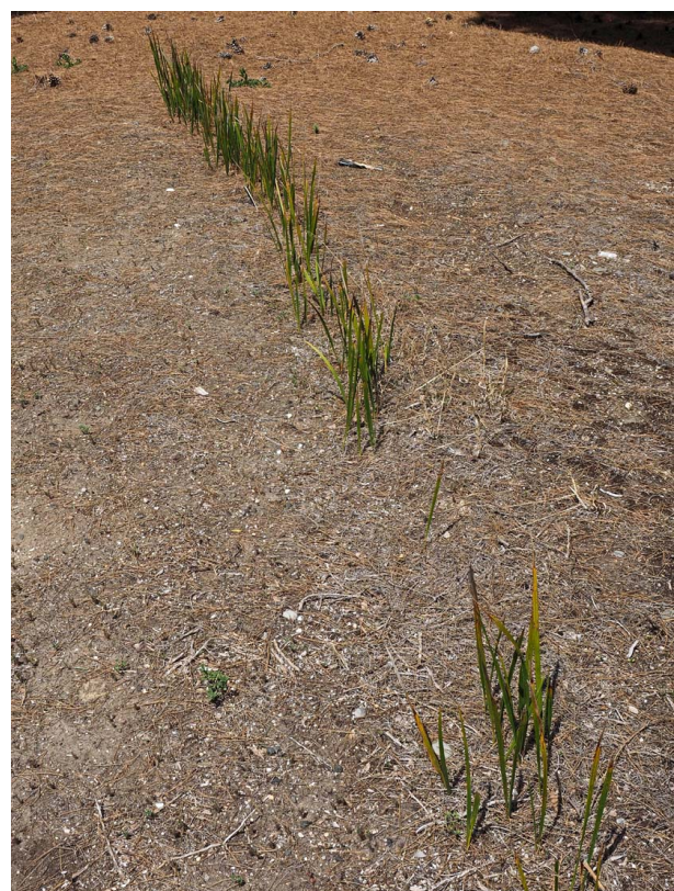
Jubaea chilensis seedlings do better in open soil than in pots. Western side of Annexe, GBG