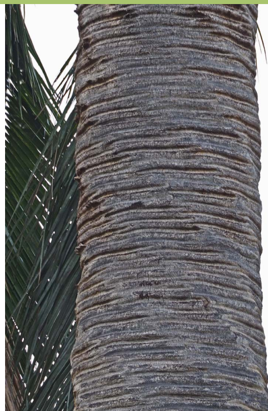
Jubaea chilensis GBG trunk