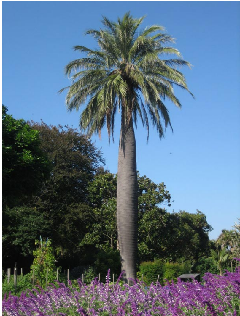
Jubaea chilensis GBG, some time ago, before deterioration of growing point.

The immense dark-grey trunk of J. chilensis grows to a vast height (up to 30 m), with a diameter of 1 m or more, and often has a swollen region though that generally tapers towards the crown. The dense crown supports between 40 and 50 green or blue grey, pinnate leaves, which on dying, fall cleanly to the ground rather than persisting on the stem. Borne amongst the leaves, the large inflorescences hang down and bear both male and female flowers. The spherical fruits are yellow or brown, and, like a mini-coconut, have a nut-like shell with three 'eyes' through which the root emerges at germination. (See photo.)